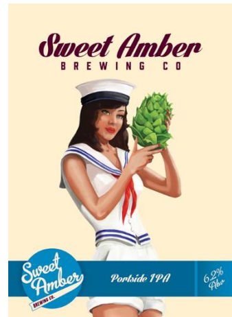
PORTSIDE IPA 6.2% Can $9 / 4-pack $30

Phone orders: Semaphore 0432 049 665 Harbour Town 0435 775 437