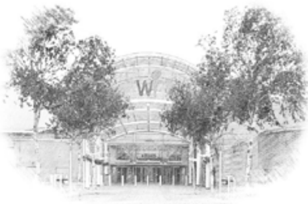
Flavour Map Number: 18

The White Rose is the symbol of Yorkshire, made famous by the War of the Roses, and has a major shopping complex in the Leeds area named after it.