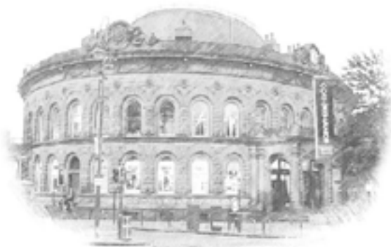
Flavour Map Number: 2

Bourbon is distilled from corn and so to represent Leeds Corn Exchange we've come up with a popcorn-twist on the classic bourbon Old Fashioned served with popcorn on the side.