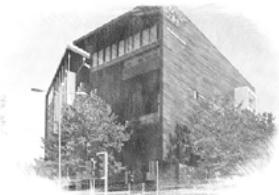
Flavour Map Number: 13

Northern Ballet is a dance company based in Leeds with a classy and sophisticated reputation – this cocktail is exactly that. Bringing together a local rhubarb gin and champagne, you wouldn't feel out of place at the ballet with this.