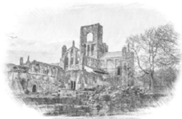
Flavour Map Number: 1

The highly distinctive Benedictine, first created by Monks in 1510 (while Kirkstall Abbey was still functioning) serves as this drink's centre-piece.