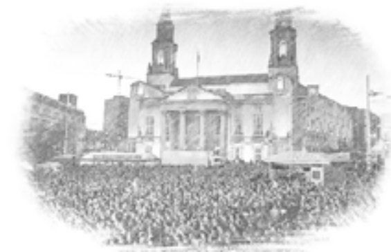
Flavour Map Number: 10

Millennium Square, commissioned by the millennium foundation was the place to go in Leeds to see in the turn of the century. Take your Sky Lounge experience to the next level with this ultimate celebration cocktail.