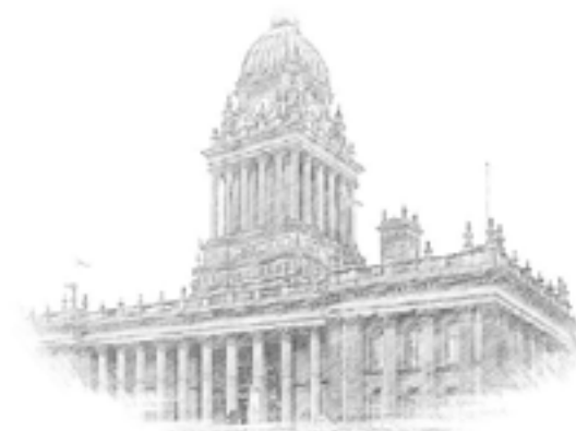
Flavour Map Number: 12

Tanqueray No. Ten Gin Chambord Cranberry Silver Lime Sugar Syrup