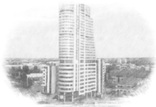
Flavour Map Number: 19

The highest building in Yorkshire, Bridgewater place is a modern icon. We wanted to celebrate some of Yorkshire's best, using two local gins, the flavour of rhubarb and the best tea in the world! Sit back and enjoy this refreshing sharing cocktail.